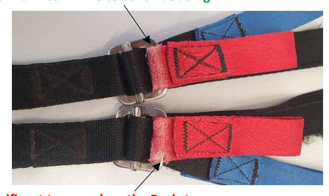
Significant tear -replace the Backstrap